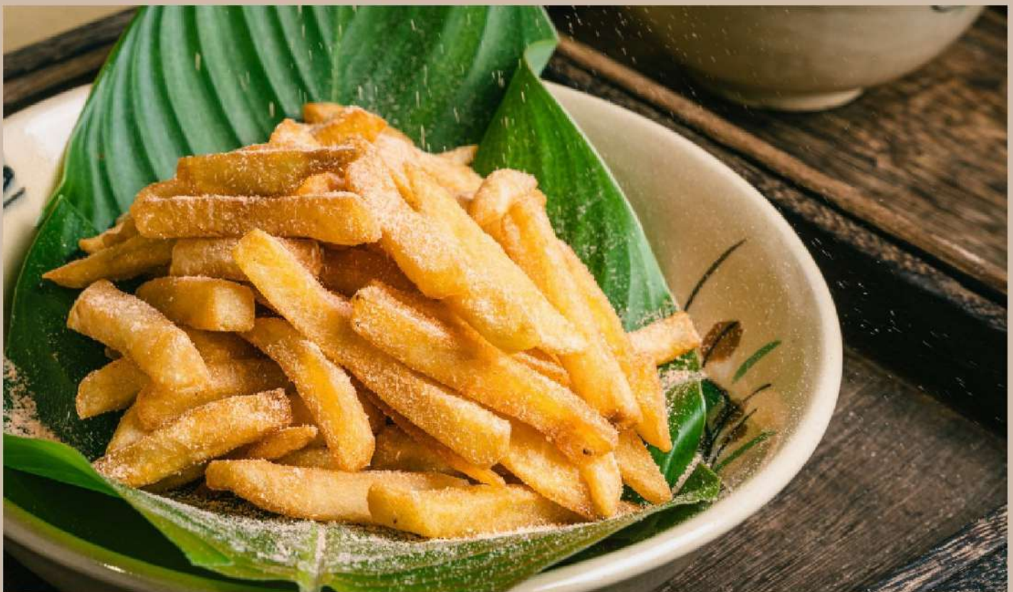
French fries with cheese powder

Khoai chiên rắc phô mai Potato, cheese powder