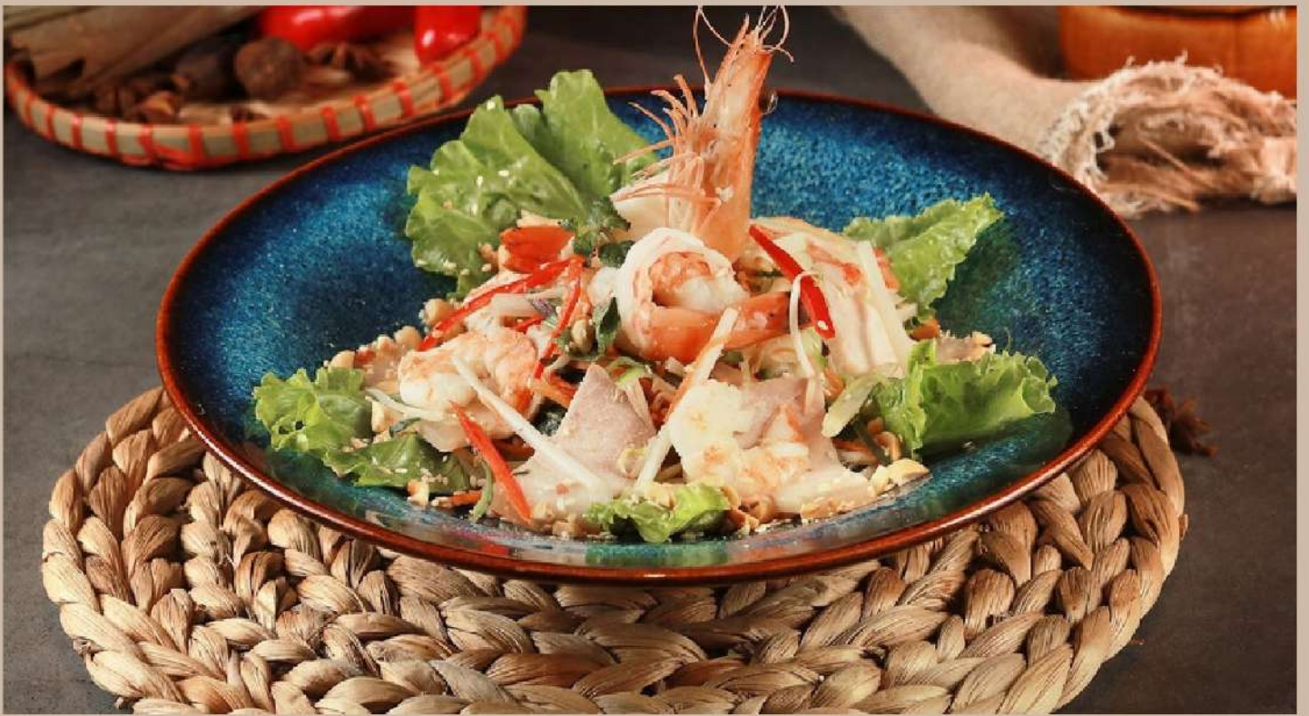
Lotus salad stem with shrimp & pork Gỏi ngó sen tôm thịt

Shrimp, pork, lotus stem, carrot, garlic, herbs, peanut, seasoning