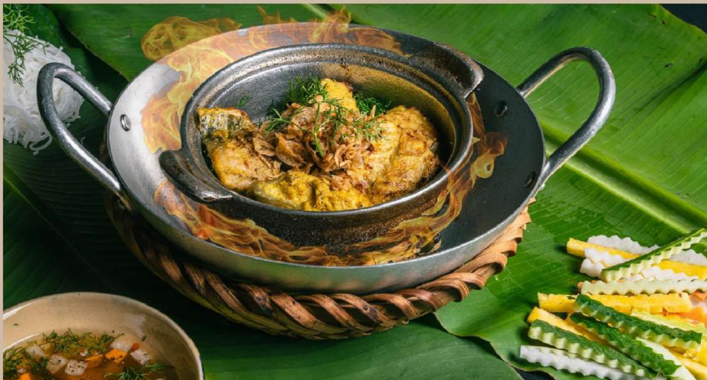
Hanoi grilled fish Chả cá lăng Hà Nội

Hemibagrus fish, galangal, dill, rice noodle, pineapple, carrot, rice paper, herbs