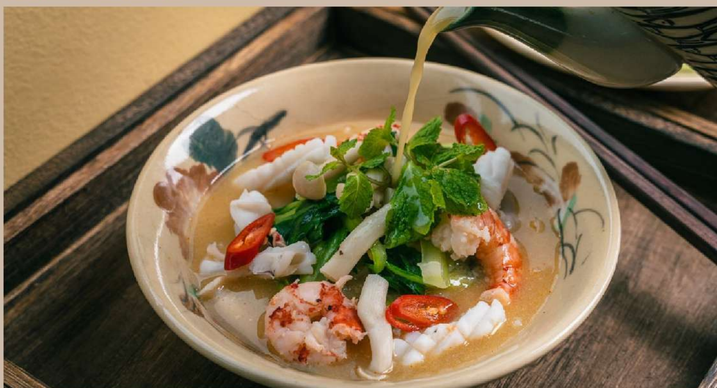
Seafood noodle soup Bún hải sản