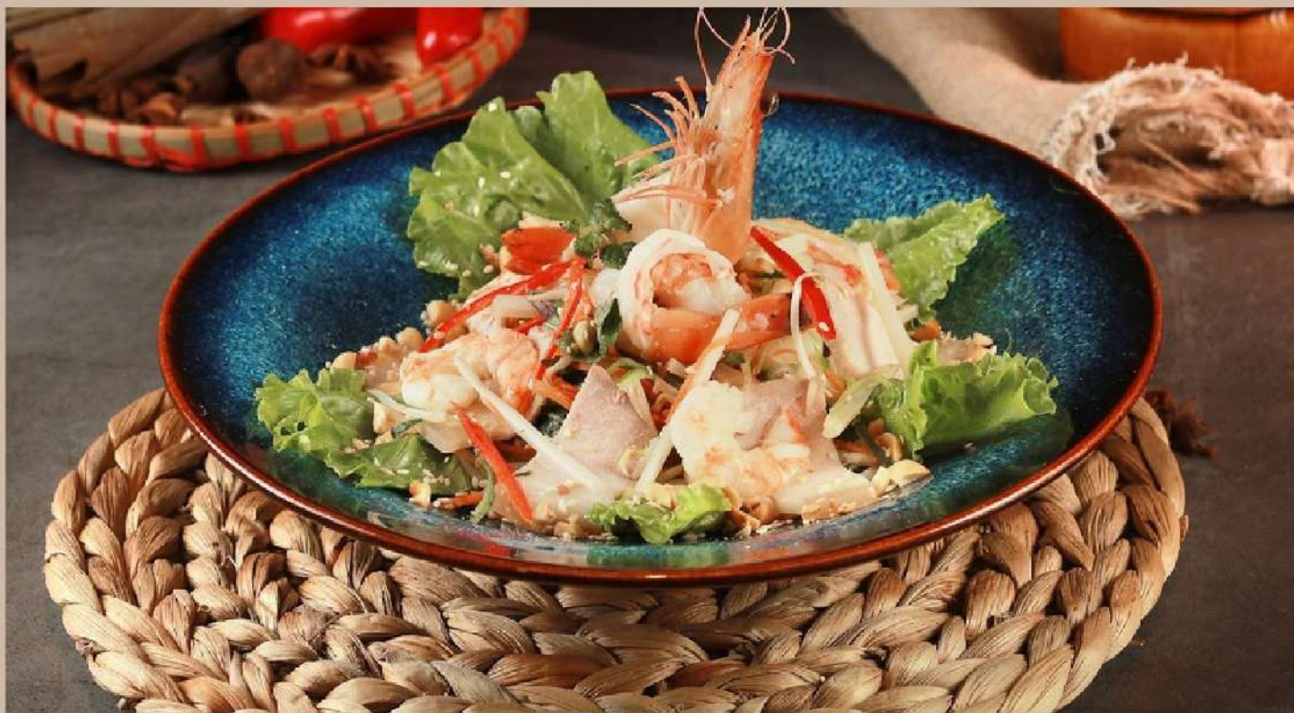
Lotus salad stem with shrimp & pork Gỏi ngó sen tôm thịt

Shrimp, pork, lotus stem, carrot, garlic, herbs, peanut, seasoning