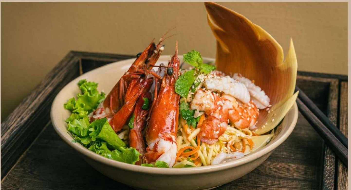
Mango seafood salad Nộm xoài hải sản

Mango, shrimp, scallops, squid, salad, fish sauce, garlic, mixed vegetable