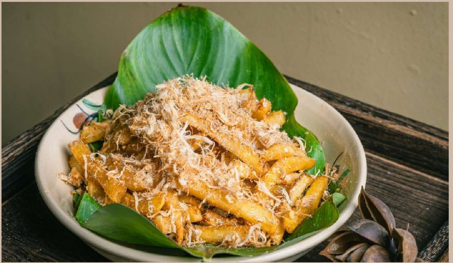
French fries with fishsauce & meat floss

Khoai chiên mắm ruốc Potato, fishsauce, pork floss