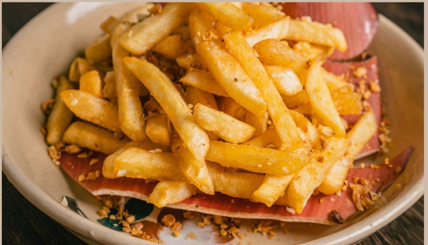
French fries with butter & garlic

Khoai chiên bơ tỏi Potato, butter, garlic