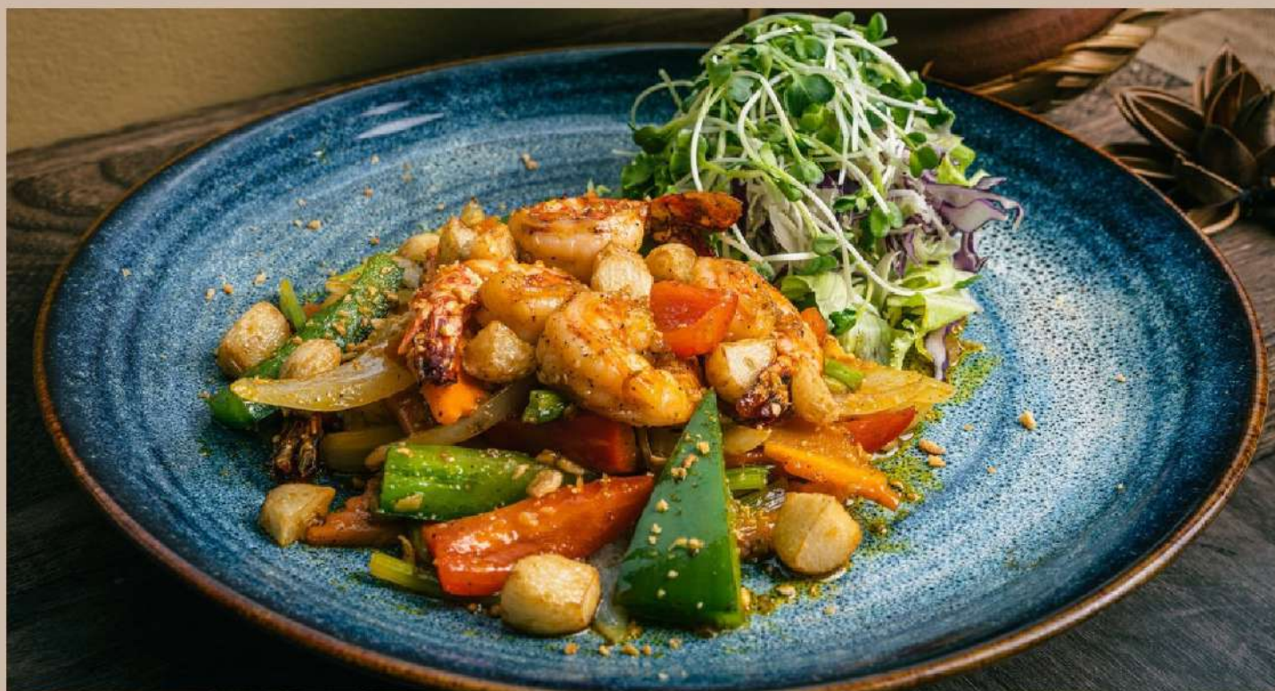
Stir-fried shrimp with garlic butter Tôm xào bơ tỏi

Shrimp, mixed vegetables, bell pepper, onion, sesame