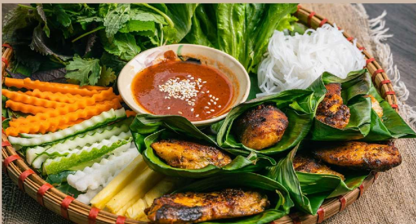
Fish grilled in banana leaves Cá nướng lá chuối

Hemibagrusfish, galangal, dill, ricenoodle, pineapple, carrot, ricepaper, herbs