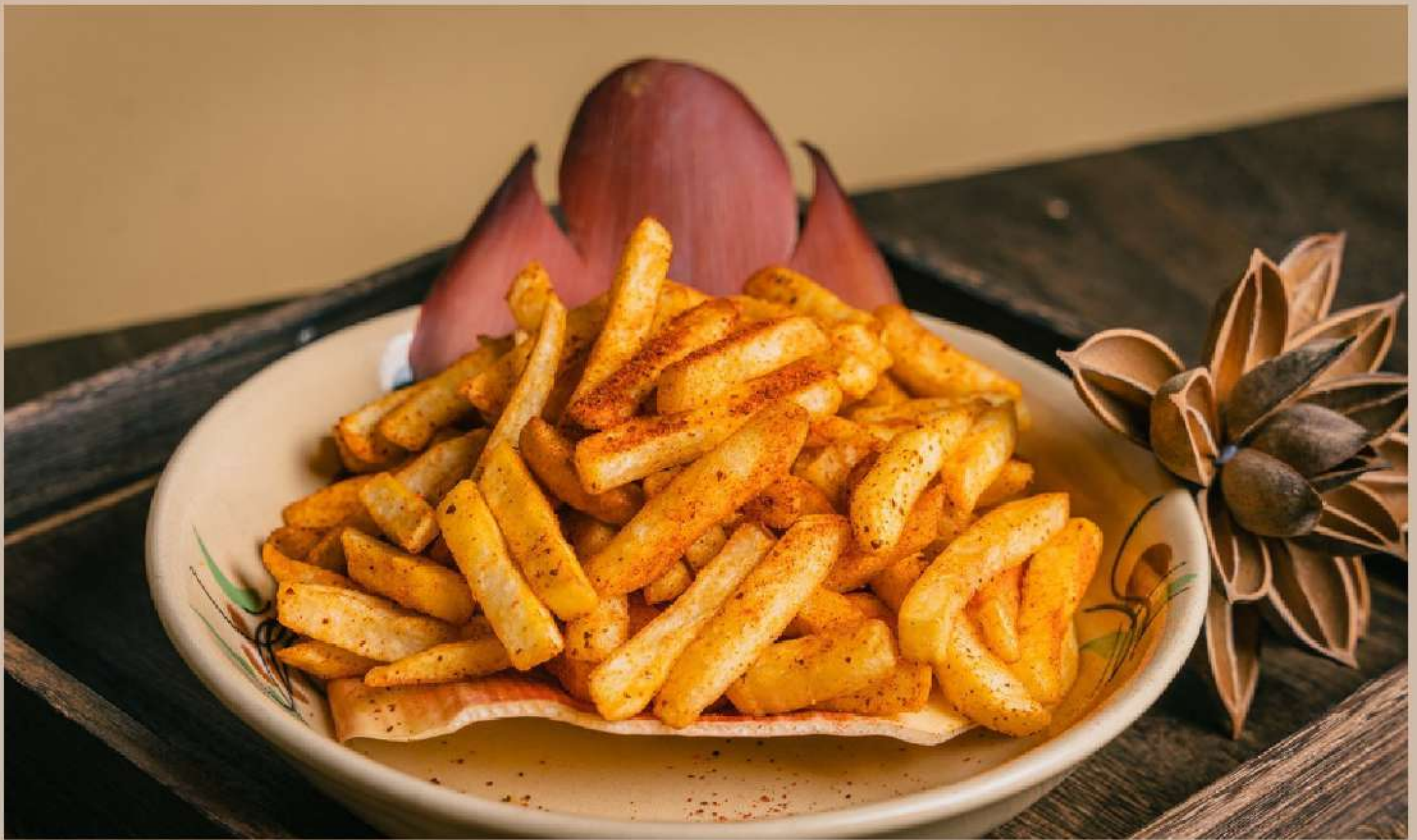
French fries with paprika