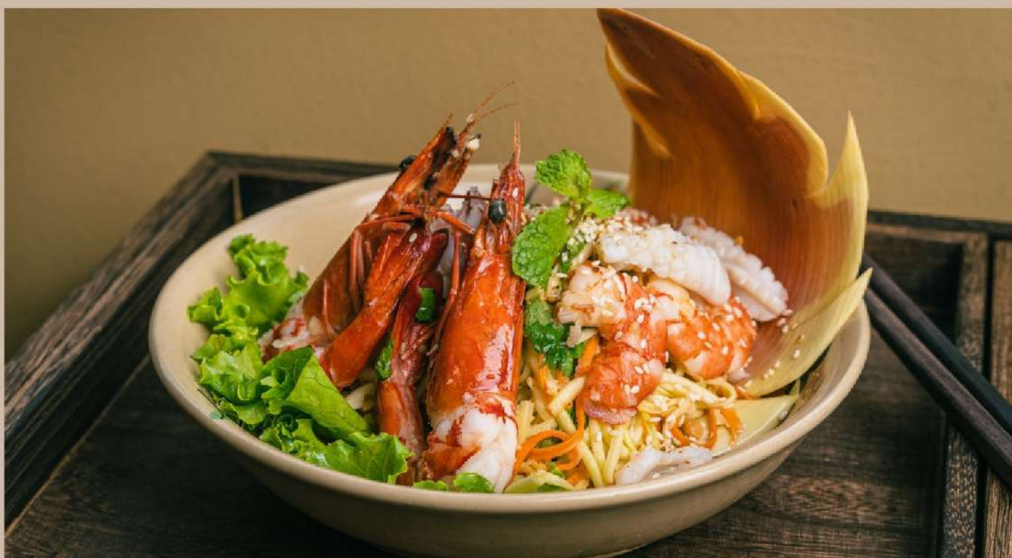
Mango seafood salad Nộm xoài hải sản

Mango, shrimp, scallops, squid, salad, fish sauce, garlic, mixed vegetable